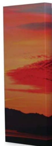
Front view (shown with optional Image Wrap™)