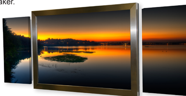
The Trilogy™ - Image III speakers shown with matching Stealth CoverArt™ display masking system. CoverArt™ and The Trilogy™ available in the USA and Canada only.

Customizable beauty is just a portion of the Image III speakers' value. Audio performance is impressive, with smooth high-frequency response, solid bass extension, excellent imaging and 170 degree dispersion.