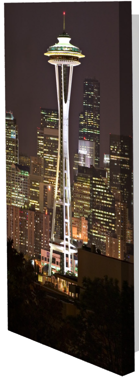
Front view (shown with optional Image Wrap™ )