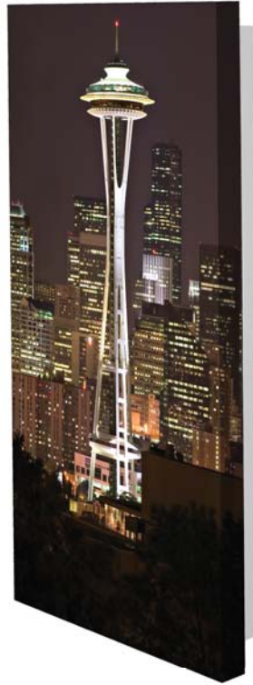
Front view (shown with optional Image Wrap™)