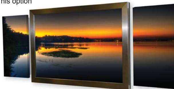
The Trilogy™ - Image III Sub speakers shown with matching Stealth CoverArt™ display masking system. CoverArt™ and The Trilogy™ available in the USA and Canada only.

Speaker installation takes only moments with the four key slots on the rear of the speaker. Simply use the included hollow wall anchors for a hassle free art speaker mounting experience.